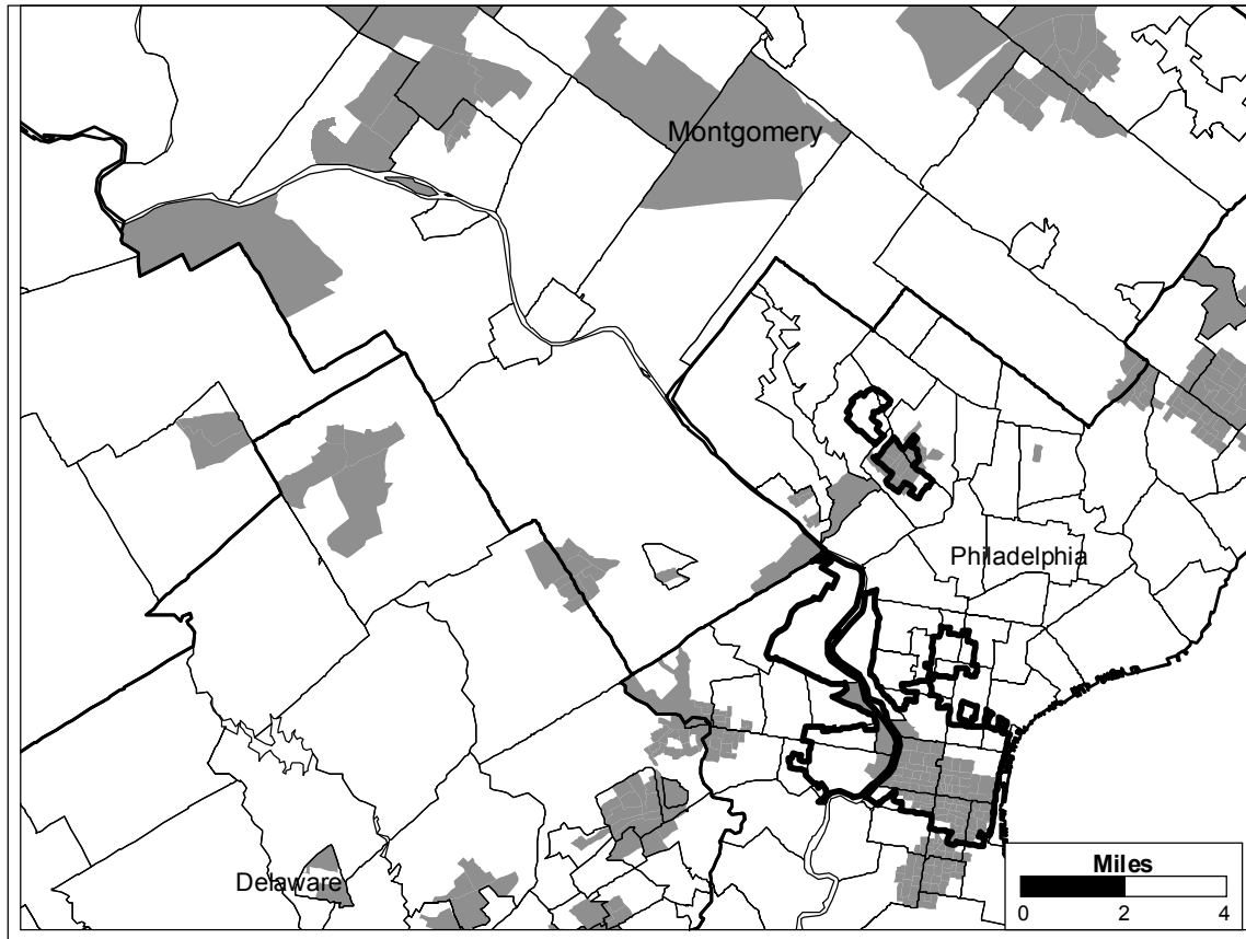
Figure 2. Block groups with highest concentration of “populist” for-profit cultural firms, Metropolitan Philadelphia, 1997. 2